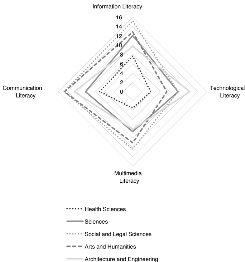
Figure 2. Development of literacies by knowledge areas